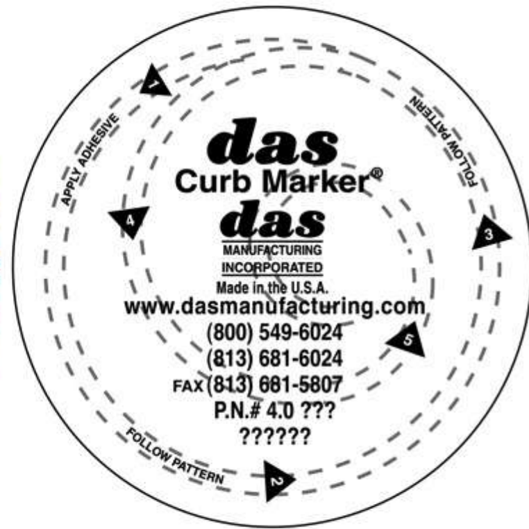
Storm drain markers